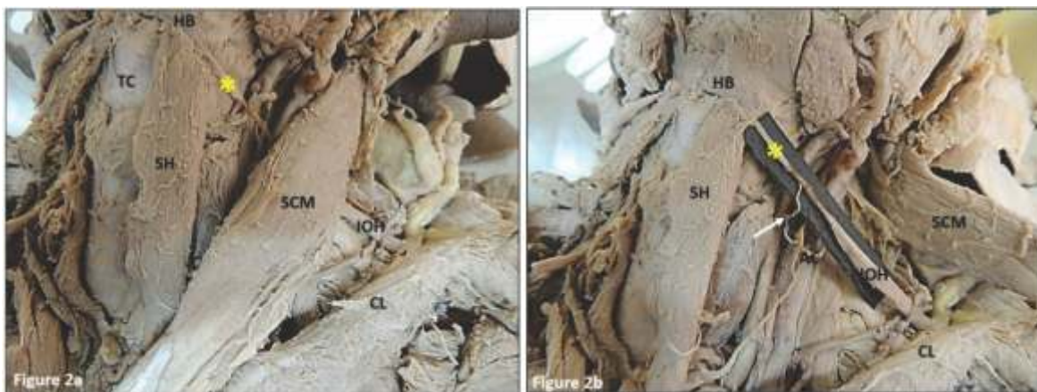
Fig. 2: Showing the Absence of the Superior Belly of Omohyoid Muscle. It was Replaced by a Tendinous Slip (*) which Later Blended with the Sternohyoid (SH) Muscle and Attached to the Hyoid Bone (HY). IB- Inferior Belly of Omohyoid, CL-Clavicle, SCM- Sternocleidomastoid