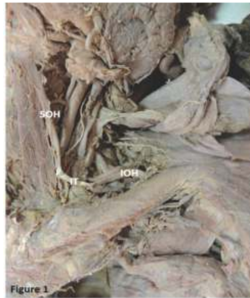
Fig. 1: Representative Image Showing the Normal Anatomy of the Omohyoid Muscle

Further the length of the neck when correlated with the dimensions of the omohyoid showed a positive linear relationship, i.e., r = 0.81, 0.58 and 0.72 for the length of the SOH, IT and IOH respectively (Fig. 3).